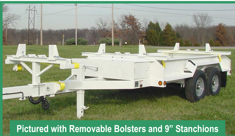
Pictured with Removable Bolsters and 9" Stanchions