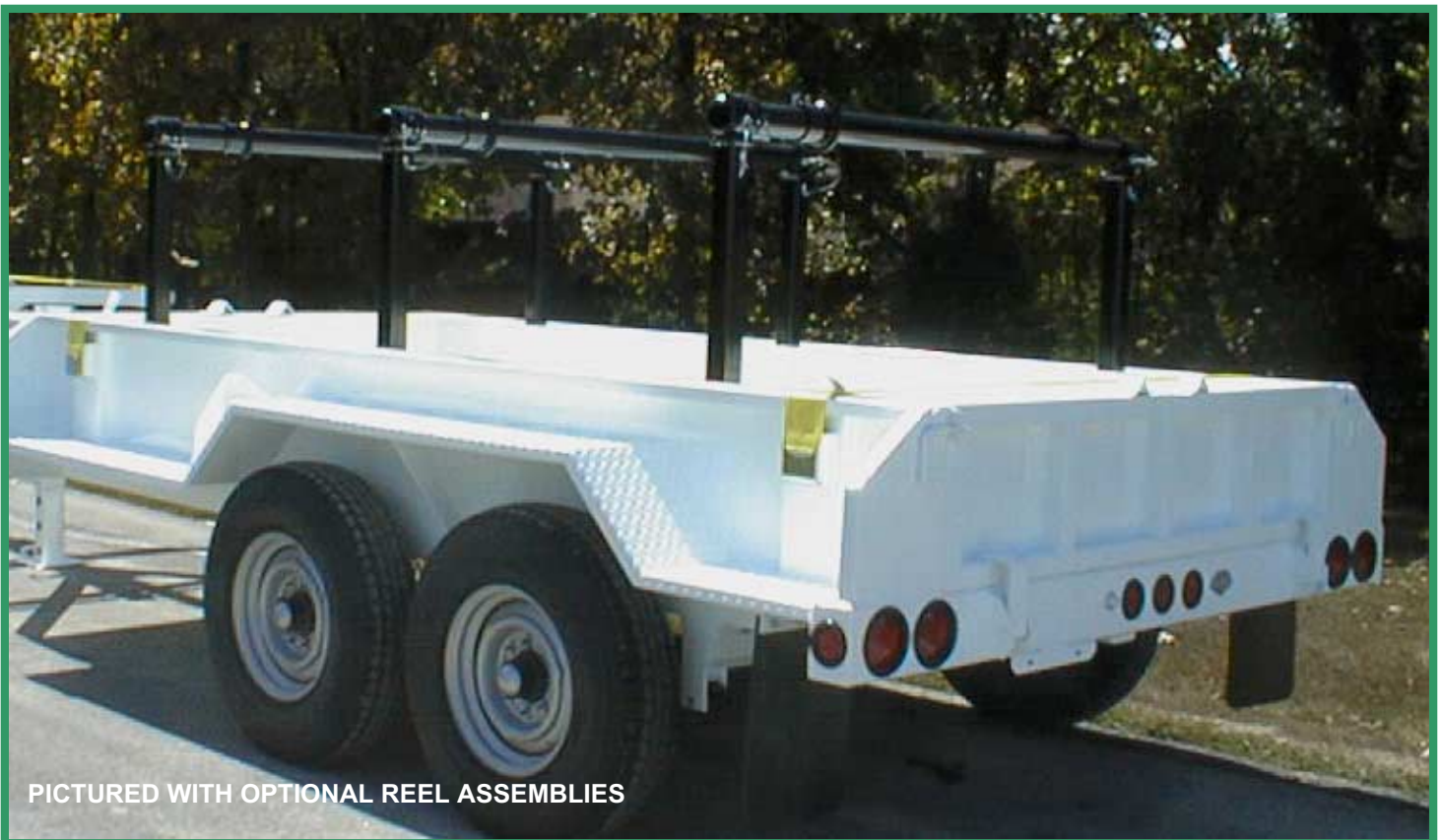
PICTURED WITH OPTIONAL REEL ASSEMBLIES