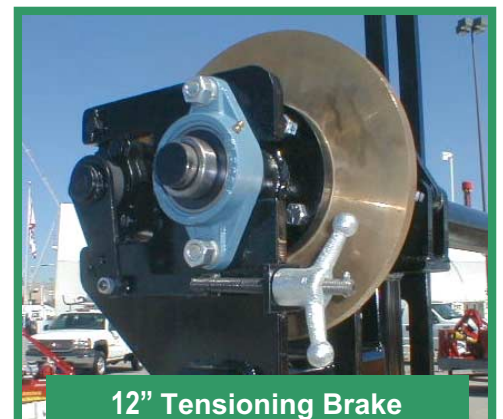
12" Tensioning Brake