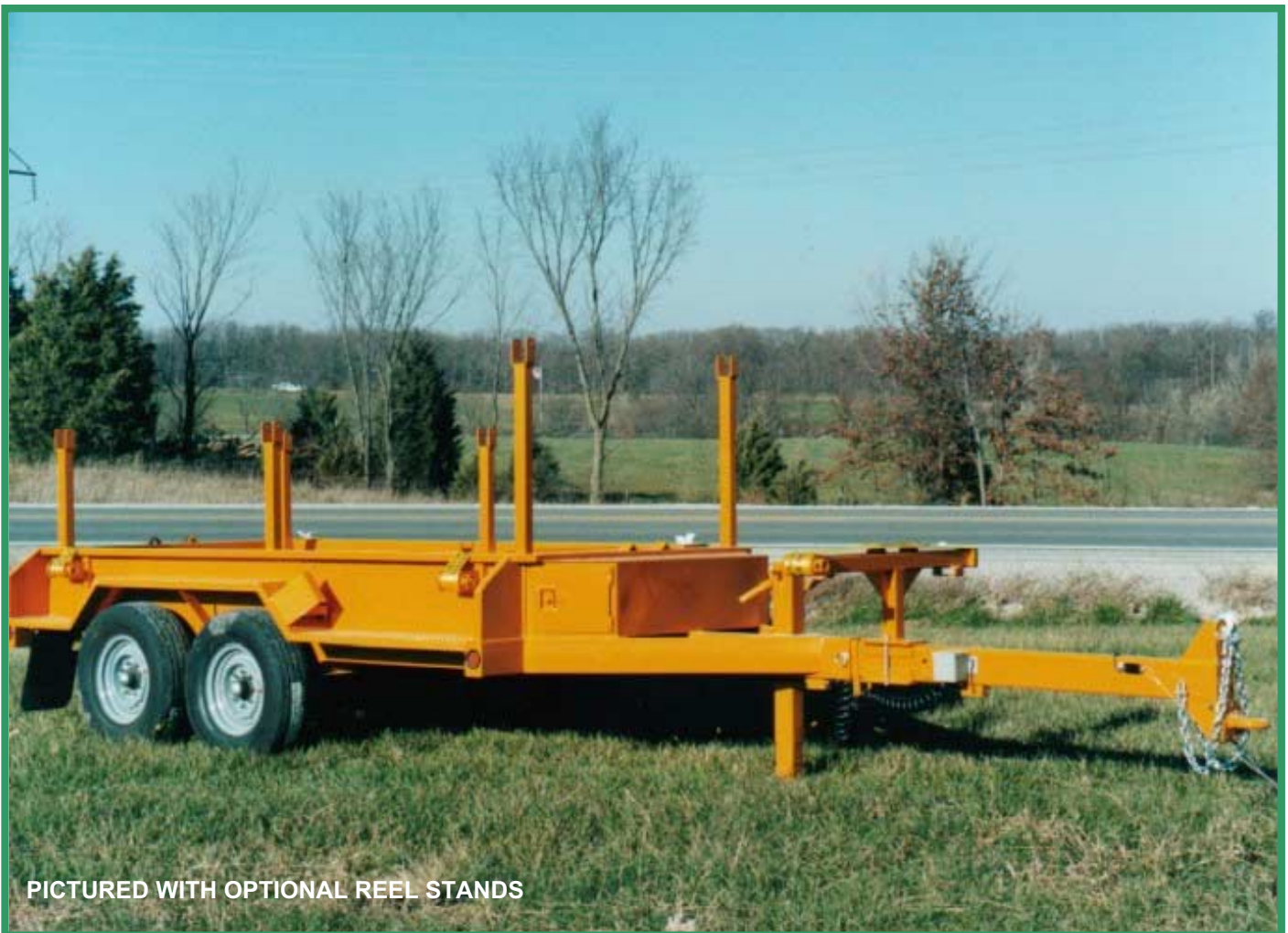
PICTURED WITH OPTIONAL REEL STANDS