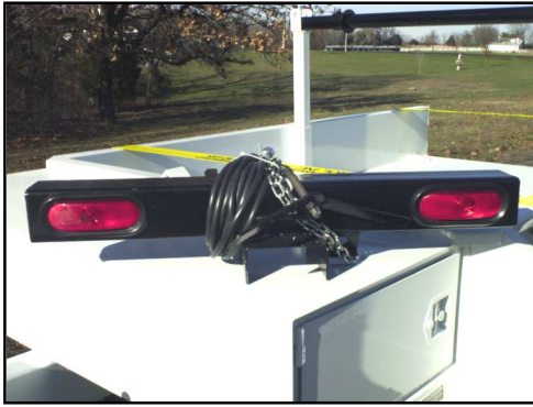
LIGHT BAR OPTION