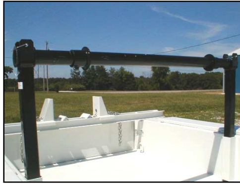
REEL RACK OPTION