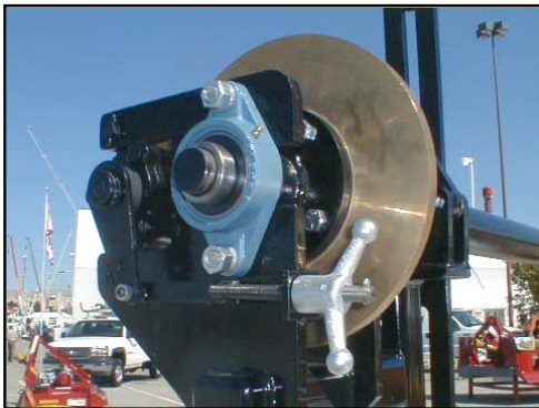
12" TENSION BRAKE OPTION