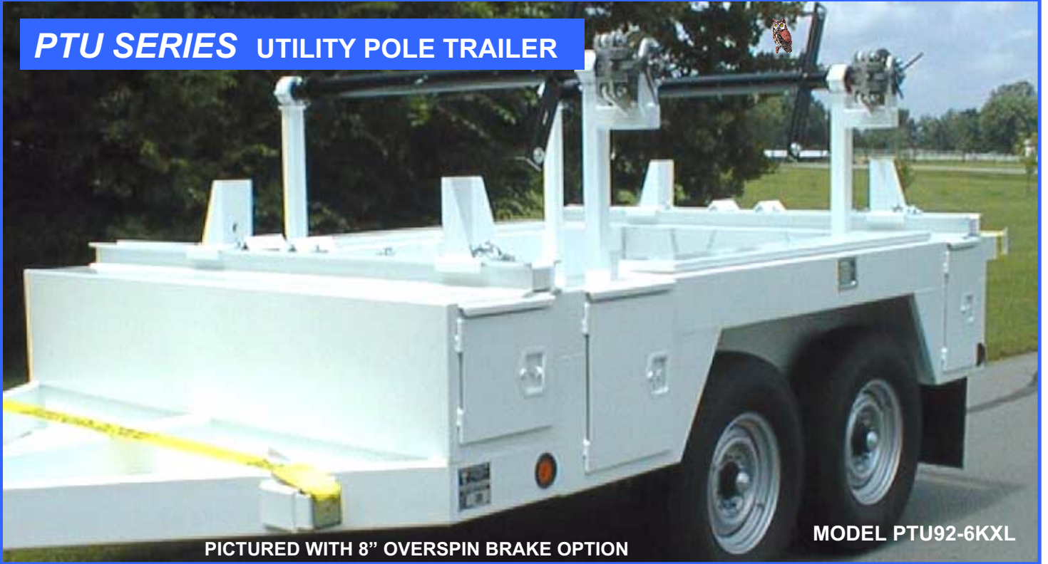
PICTURED WITH 8" OVERSPIN BRAKE OPTION